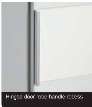
Hinged door robe handle recess