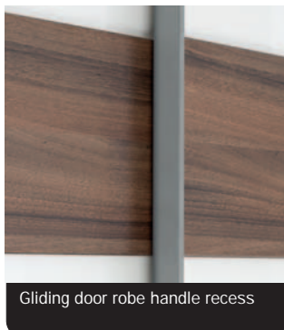
Gliding door robe handle recess